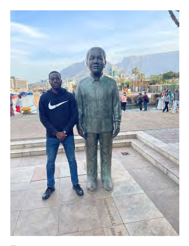
V&A Water Front