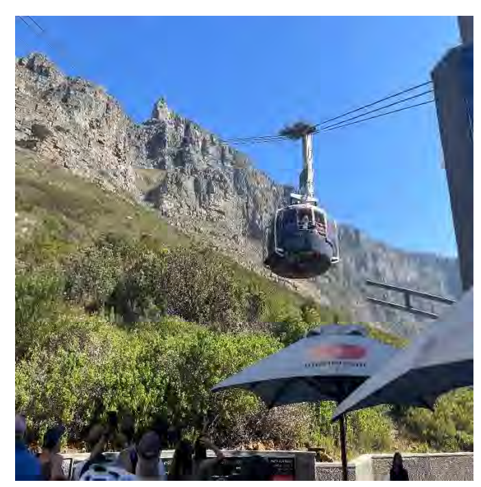
Table Mountain National Park