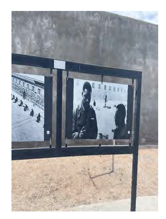
Visit to Robben Island