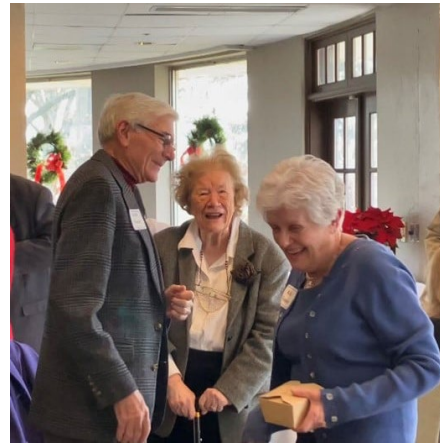
UMSL Retirees Association members enjoying the annual Holiday Luncheon

Future plans include engaging membership in Retiree's and Alumni Associations' events, plans for contacting faculty and staff preparing for retirement and updating local and system wide offices' contact information for our members. We are also considering options for social activities such as tours of historic St. Louis museums.