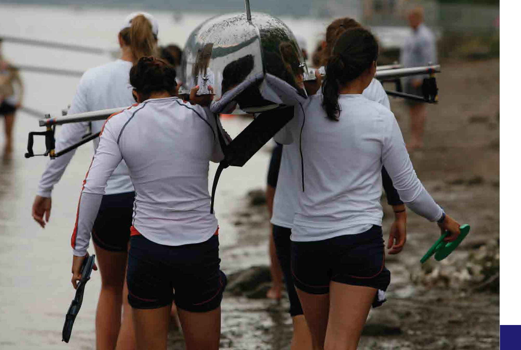
Table of Cont

Chapter 1: Backgro Introduc A Reviev Pregr